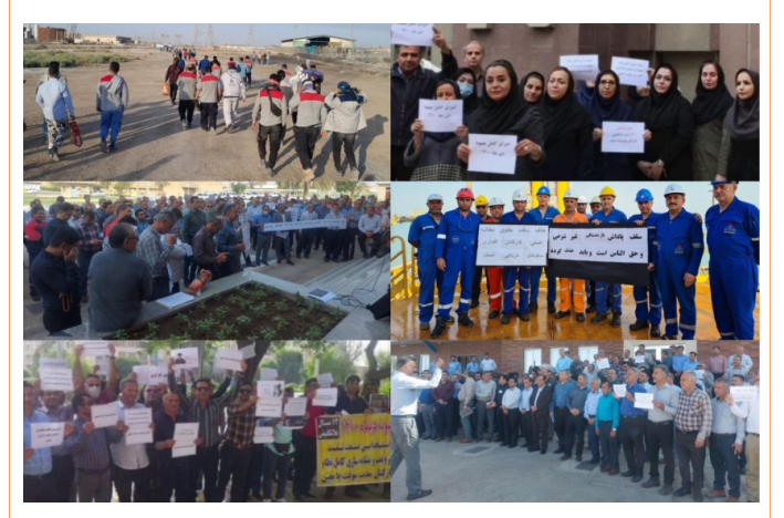
Formal workers of Aghajari Oil and Gas Company and gatherings in different oil companies

On Monday, November 6, as well as the previous day, the formal oil workers, working in the Aghajari Oil and Gas Exploitation Company, gathered in protest against the government's livelihood attacks and non-response to their demands. The workers of this company have been protesting every day. The formal oil workers working in the Southern Oil Regions Company located in Ahvaz, Falat Ghareh in Khark Island, and the Falat Ghahreh in Siri region held a protest rally. The formal workers of different oil regions have announced Sunday, Monday and Tuesday as their fixed protest days until their demands are met.